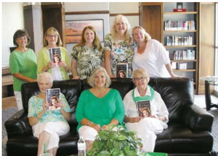
Birthday greetings to Maureen O'Hara on her 95th birthday.