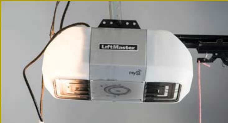
LiftMaster garage door opener.

After a little bit of investigation, I discovered that I do have a smart garage as do most of the residents of Avimor. If your garage door opener looks like the one in this photo, and it's a "MyQ" garage door opener, it's "smart".