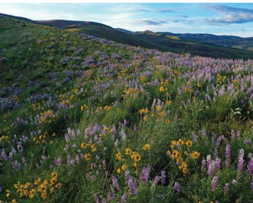
Springtime blooming at Avimor.