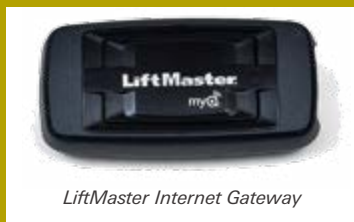
LiftMaster Internet Gateway

Apparently the Internet Gateway enables other things as well, like turning on lights and unlocking doors, but I'm not ready for that. No real harm will come if I forget a light now and then. However, if it watered my tomato plants and fed the cat, I might reconsider and set up the more extensive system.